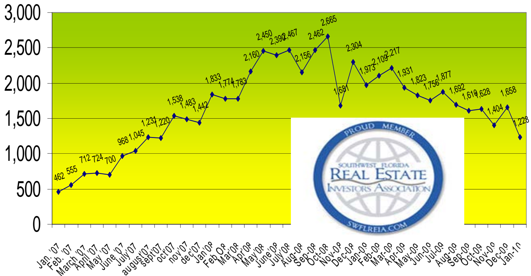
Total Lis Pendens, Culled to Mortgage Foreclosures